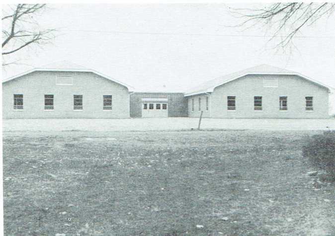
ST. FRANCIS PARISH HALL, COMPLETED 1960